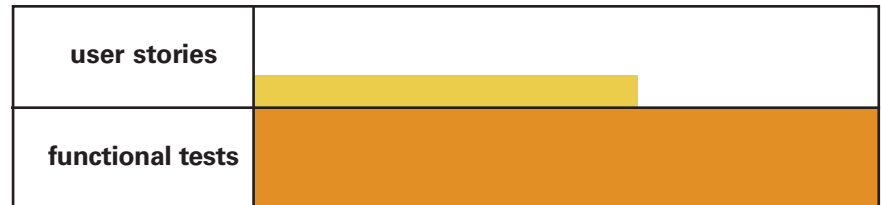
Figure 1: Cinderella XP Artifact Density Graph

When defining the elements of an Agile requirements process, the target is